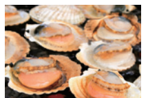
Scallop The busy scallop farms of Shikabe.