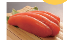
Cod roe Shikabe's famous Tarako products have their own brand.